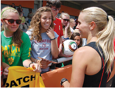
Heather Mitts signing autographs for fans in 2011.

Upon the introduction of Women's Professional Soccer , Mitts and fellow USWNT players Angela Hucles and Kristine Lilly were allocated to the Boston Breakers on September 16, 2008. [9] In the inaugural 2009 Women's Professional Soccer season, Mitts appeared in nineteen games (all starts, 1,631 minutes) and added an assist. [10] After the season, the Boston Breakers declared Mitts a free agent.