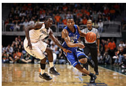
Nolan (2) was named ACC Player of the Year in 2011.

As a senior in 2010–11, Smith started 37 games as he averaged 20.6 points, 4.5 rebounds, 5.1 assists and 1.2 steals per game. [8] He was named the 12th ACC Player of the Year in school history after becoming the 11th Duke player to lead the league in scoring. He earned first-team All-ACC and ACC All-Defensive team honors, and NABC and USBWA first-team All-District honors after leading Duke to a 32-5 record and a third consecutive ACC championship. He was also a finalist for the Naismith Trophy, Wooden Award, Oscar Robertson Trophy and Bob Cousy Award. [4]