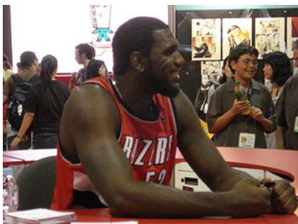
Oden at the 2008 San Diego Comic-Con

On April 20, 2007, Oden announced that he would be entering the 2007 NBA draft . On June 28, 2007, he was selected by the Portland Trail Blazers with the #1 overall pick. To begin his Trail Blazers career, Oden chose the uniform number 52. On July 1, before his first NBA practice, Oden was signed to a contract which provided for two guaranteed seasons and team options for third and fourth seasons. On September 14, 2007, Oden had microfracture surgery on his ailing right knee. He missed the entire season. [15] Oden's progress was recorded on the Trail Blazers' website and his blog .