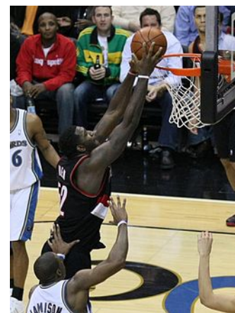
Oden dunking in a game while with Portland

On December 9, 2011, the Trail Blazers announced that Oden had suffered an unspecified "setback" that left them less optimistic about his ability to play in the 2011–2012 season. Rather than signing an 8.9-million-dollar qualifying offer , Oden and the team negotiated a different offer. [23] On February 3, 2012, Oden underwent arthroscopic surgery on his right knee. [24] On February 20, 2012, Oden was scheduled for a procedure on his left knee similar to the procedure he underwent 17 days earlier. However, during the operation, further damage to the articular cartilage was discovered, and Oden underwent his third micro-fracture surgery . [25]